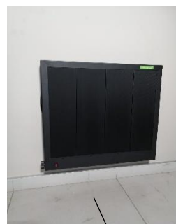
Hang the device at a height of at least 15 cm from the floor