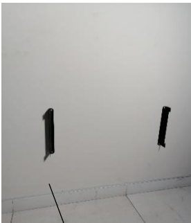
Wall mount brackets