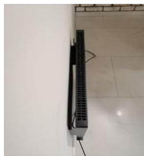
Hang the device on the hanging brackets