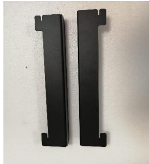
Wall hanging bracket